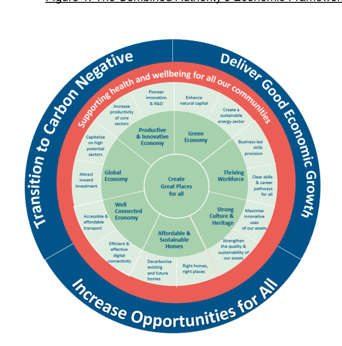
Figure 1: The Combined Authority's Economic Framework

15. To note, in response to the Mayor's pledges, an initial, high level overview of key priorities has been developed by the Combined Authority that builds on the economic framework. This is presented in a paper at the Combined Authority on 31 May and is shown below as Figure 2. The York pipeline will seek to reflect the priorities identified and others that emerge.